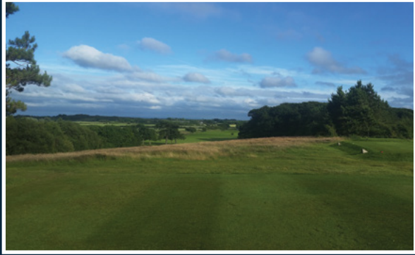
Tenth hole. Danger to the left and right. Drive straight down the middle