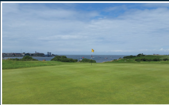
On the green fourth hole. Take in the view (after a successful putt) Wyre Estuary, Morecambe Bay & the Lakeland Fells