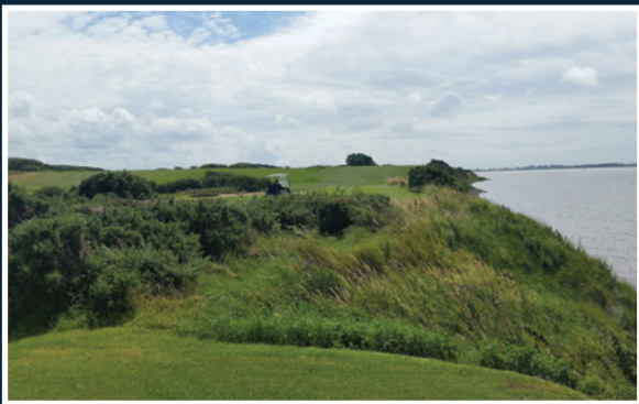
Hole four. A straight drive or keep left