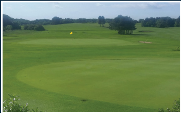
Eighteenth hole. The end of a superb round of golf on a great course