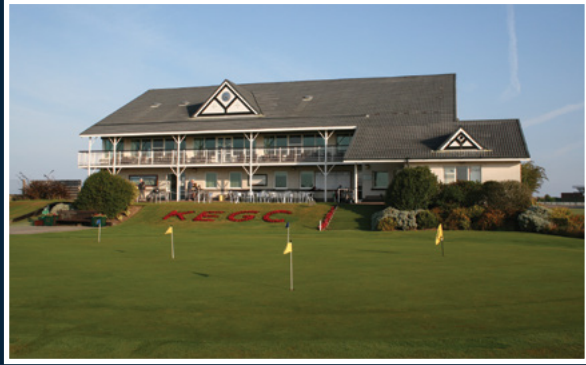
Unwind, relax, admire the views