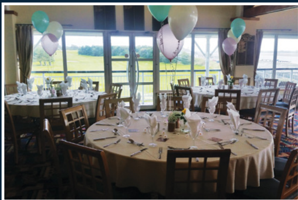
For every occasion: weddings, birthdays, parties, christenings, family gatherings & funerals. Large car park, lift, & disabled facilities.